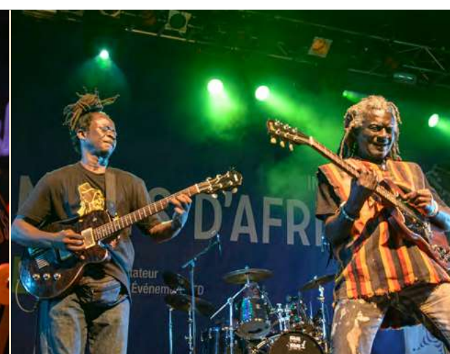
Sierra Leone's Refugee All Stars • 2012