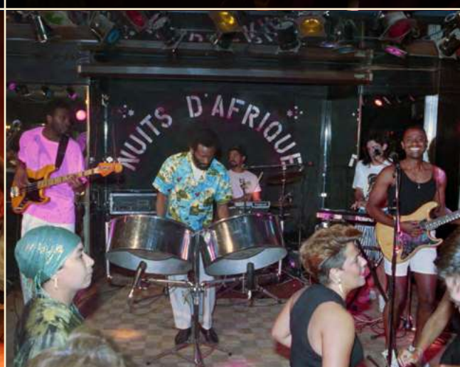
Jab Djab • 1988 - 1991 - 2002 - 2008 - 2021