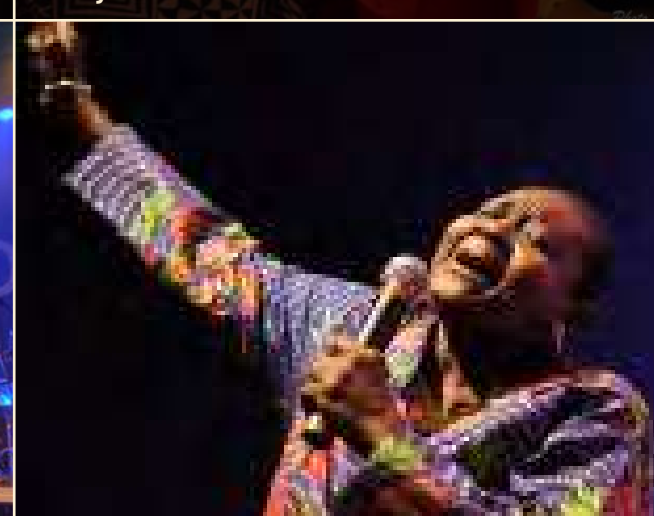
Calypso Rose feat Shurwayne Winchester • 2012