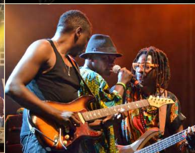
Mokoomba • 2017