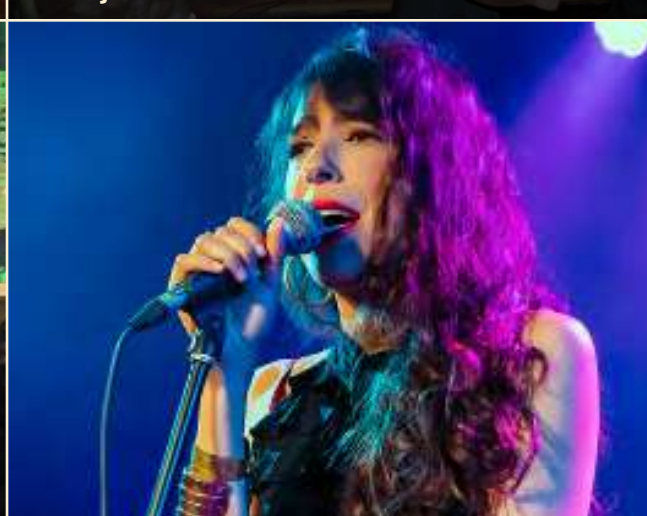
Djazia Satour • 2018