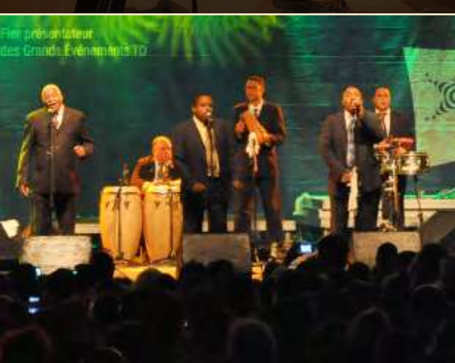
Orquesta Aragon • 2013 - 2016