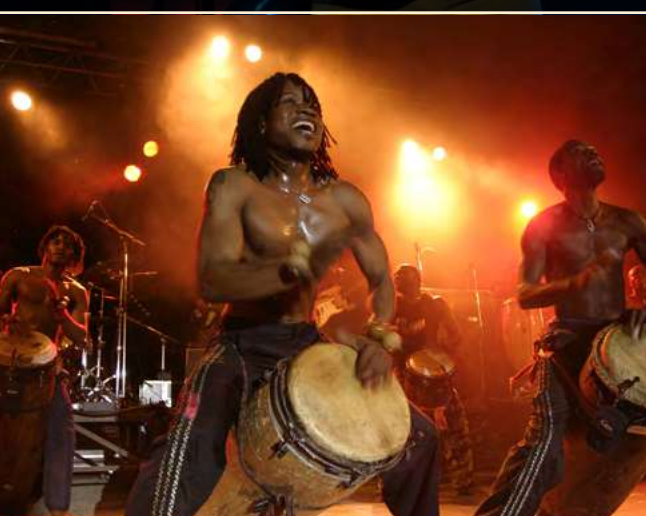
Les Tambours de Brazza • 2012