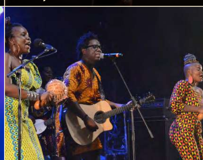
Bénin International Musical • 2019