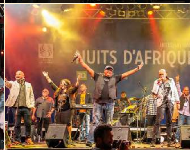
Formell y Los Van Van • 2014 - 2015