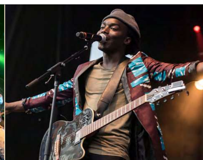
Ilam • 2016 - 2017 - 2020