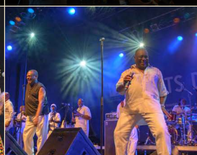
Tabou Combo • 2014 - 2016 - 2019